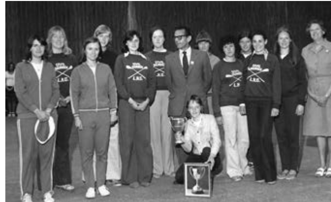
Above: CSLRC winners of the Charlton Cup at Nottingham International Regatta, 1974