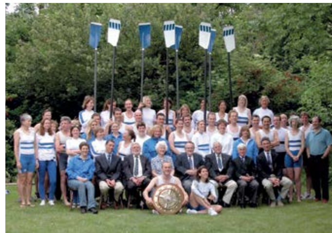
Below: Joint club photo, Civil Service Boathouse, 2003