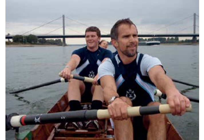
Above: 'Enjoying' the Rhine Marathon, 2011

Generations pass, but the Head of the River and the Rhine Marathon remain firm fixtures in both clubs' annual fixtures lists. Socially, Cygnet and Benrath have jointly marked their respective centenaries in 1990 and 2008 with much fanfare. A reminder of the relationship between the two clubs is the ship's bell that hangs in the bar at the Civil Service Boathouse. This bell, presented by Benrath in 1981, is ceremoniously rung by anyone wishing to buy drinks for all those present in the bar, nay, hearing distance.